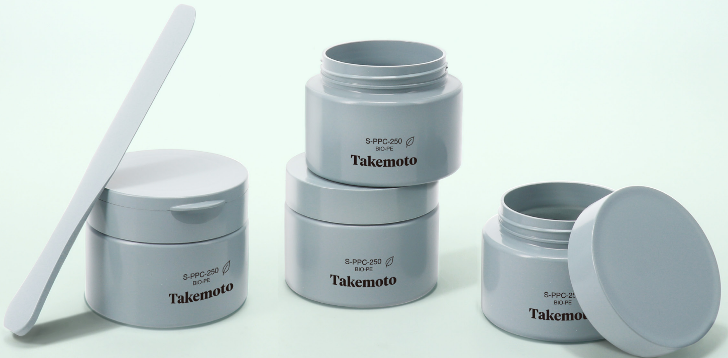
Caps ( from the left ) : C-80 Flip-Top Cap / C-80 W CAP Jars : S-PPC-250 Spatula : SpaBody